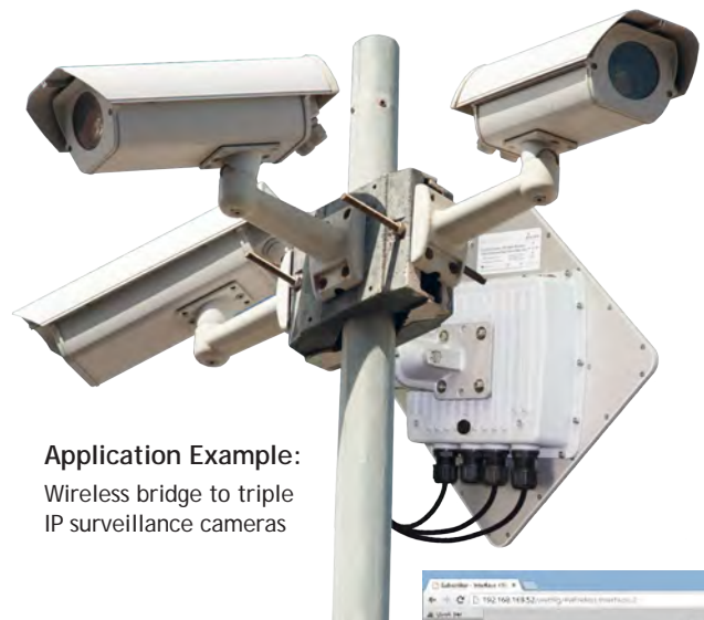
Application Example: Wireless bridge to triple IP surveillance cameras