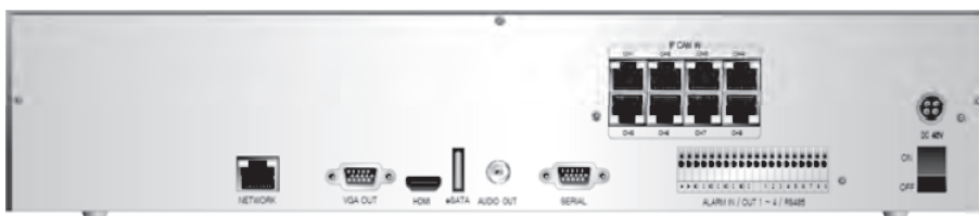
NVR8P Rear Panel View

LB3L Digital Video eSATA External Storage Devices Recorder Lockbox See eSATA External Storage Category