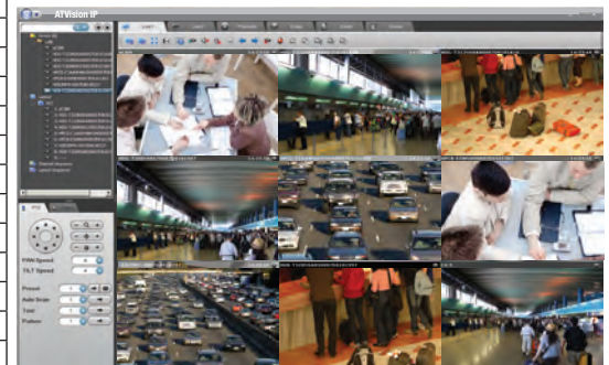
ATVision IP Remote Management Software