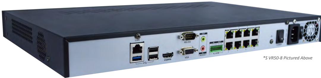
*S VR50-8 Pictured Above

For your convenience, 3xLOGIC offers a complete line of 1U servers to support any access control application. All servers come with Microsoft Windows and Intelli-M Access Software pre-installed and preconfigured. All servers come with an Intelli-M Access Essentials unlimited door license. They're ready to go – straight out of the box!