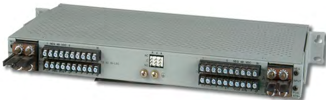
OHPGMT05R Rear View