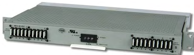
OHPGMT05R Front View