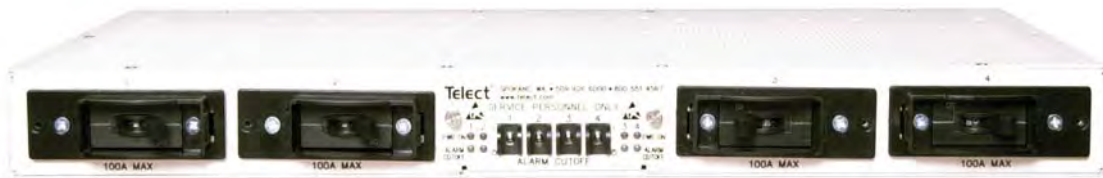
009-7000-0104 Front view

Notes: Panel ships without circuit breakers. Mounting faceplate and breakers must be ordered separately. See page two for ordering information. A TPC or TPS/TLS fuse version of this panel is also available (Telect part number 009-7001-0104).