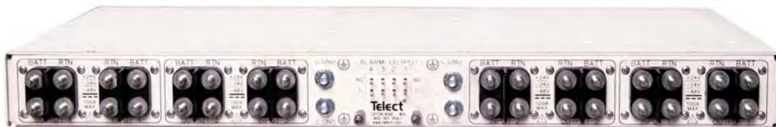
009-7000-0104 Rear view