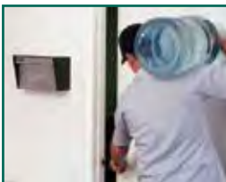
flash entry codes allow entry on a single day only, then automatically deactivate themselves