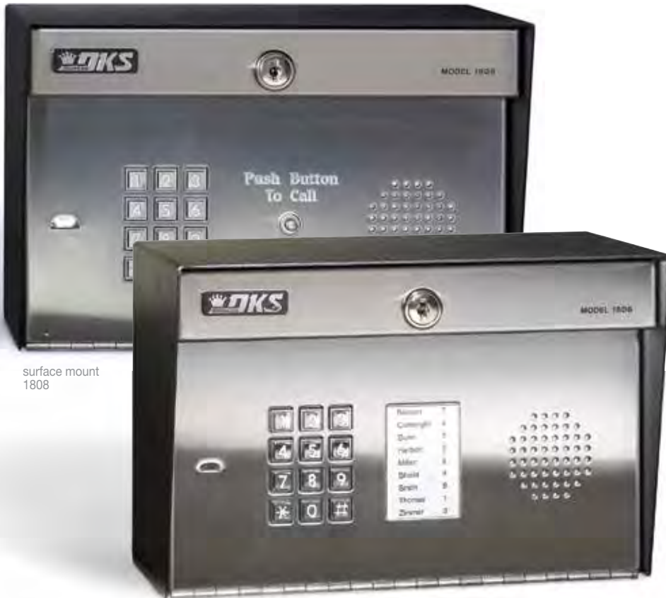
surface mount 1808

IDEAL FOR RESIDENTIAL AND SMALL COMMERCIAL OR APARTMENT APPLICATIONS