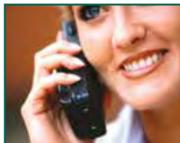
talk to your guest at a front door or gate from any telephone in the house