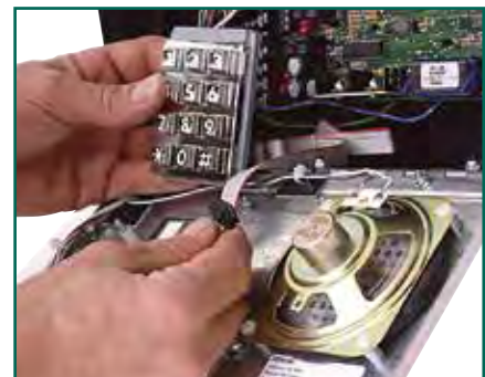
modular design makes installation and service easy