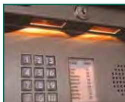
led lighting illuminates keypad and directory