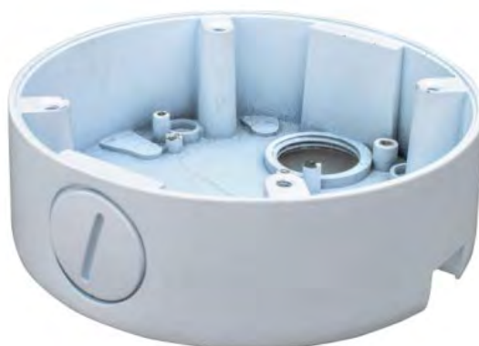
PBOX-A32 Junction Box