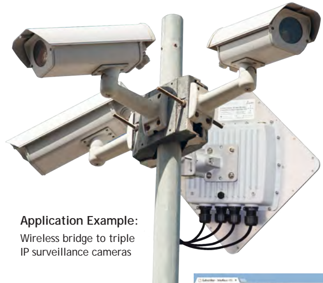
Application Example: Wireless bridge to triple IP surveillance cameras