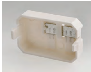
Common base for wall and ceiling with 5 mounting options