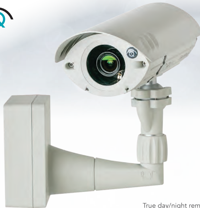
True day/night removable IR filter