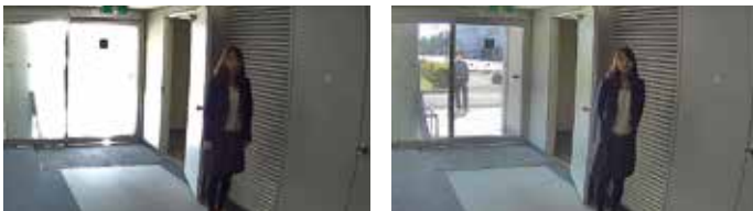
OFF ON Actual images