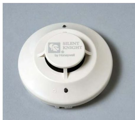
SK-Photo (Base included)