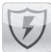
Branch Circuit Protection