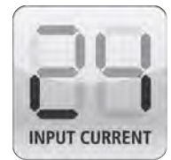
Auto-Flip Current Display