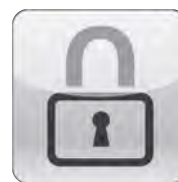
High Retention Locking Outlets