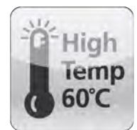
High Temperature Rating