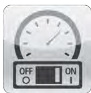
Branch Current Monitoring