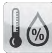
Temperature/ Humidity Monitoring