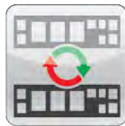
Hot-Swap Network Card