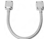
Armored Door Cord Aluminum ends, 17"