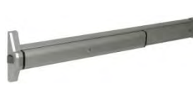
Modern Flat Rim-Type Exit Device