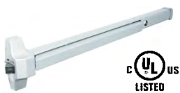
Rim-Type Exit Device