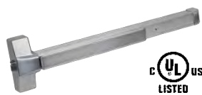
Rugged Grade 1 Rim-Type Exit Device