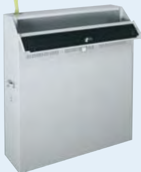
WRP-6 shown with top cover open