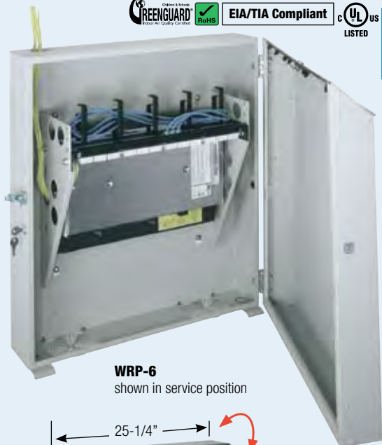
WRP-6 shown in service position