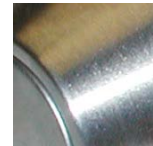
626 U.S. = US26D Satin Chrome