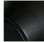
613 U.S. = US10B Dark Bronze, Oil Rubbed