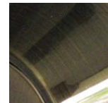
609 U.S. = US5 Antique Brass