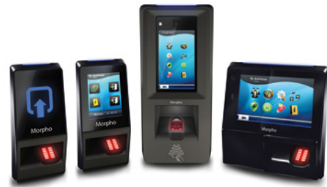
THE SIGMA FAMILY

With the entire SIGMA Family, integrators have a complete range of biometric terminals at their disposal, compatible with each other, to secure any kind of use case scenario – whether indoors or outdoors – with the World's most accurate fingerprint technology.