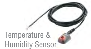
Temperature & Humidity Sensor