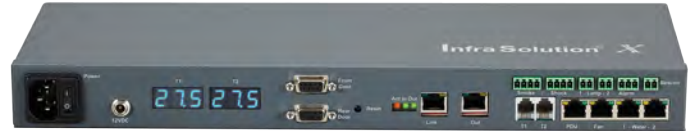
X-2000 - Rack Access Control + Integrated Device(s)