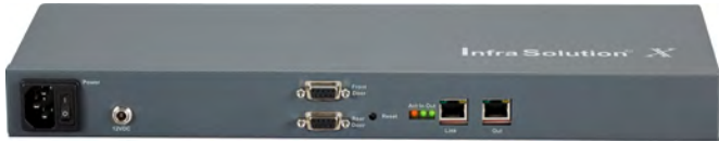
X-1000 - Rack Access Control