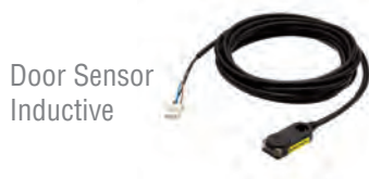
Door Sensor Inductive