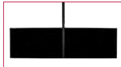
Seamless Display Alignment