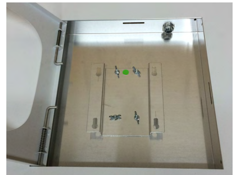
Integrated Mounting Plate, Cord Grip and Repositionable Door