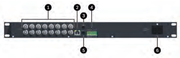
VIDEOJET multi 4000 rear