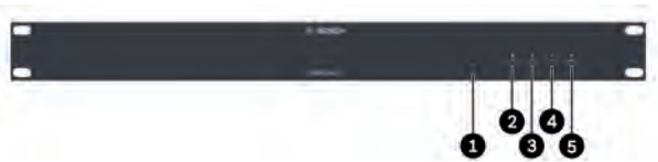
VIDEOJET multi 4000 front