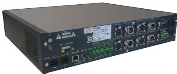
PRS-NCO3 rear view