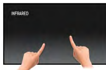
TOUCH TECHNOLOGY - INFRARED

AMVA3 technology offers higher contrast, darker blacks and much better viewing angles than standard TN technology. The screen will look good no matter what angle you look at it.