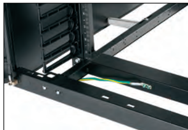
Bond cabinets to the telecommunications grounding infrastructure with single connection, reducing installation time