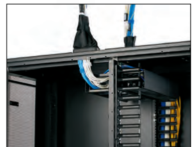
Out-set cable entry improves floor space utilization up to 5%