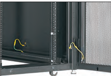
Bonded doors and side panels provide a complete bonded cabinet for protection of equipment and personnel