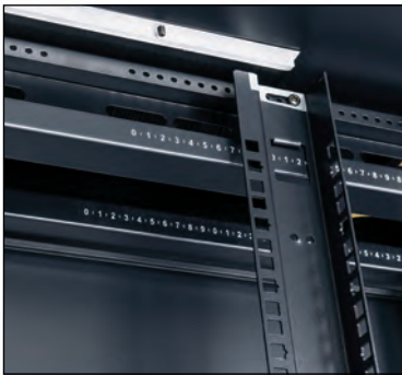
Fully adjustable equipment rails with easy to read horizontal markings for the most versatile applications