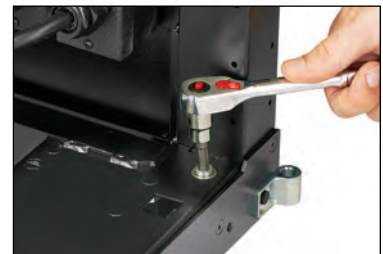
Innovative leveling feet design reduces cabinet installation time by up to 80%