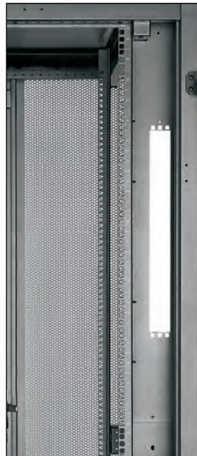
Integral vertical blanking panels in the 800mm wide cabinet offers 4 zero RU vertical openings that improve floor space utilization by up to 10%