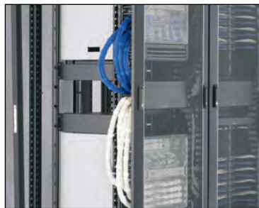
Open rail mounting creates more cable management space and equipment positioning flexibility