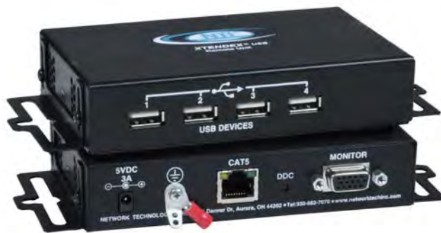
ST-C5USBVT (Remote Unit, Front and Back)

The XTENDEX® Transparent VGA USB Extender extends four USB devices and a VGA monitor up to 200 feet. Each USB extender consists of a local unit that connects to a computer and also supplies video to a local monitor, and a remote unit that connects to four USB devices and a monitor.