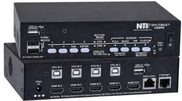
SPLITMUX-USBHD-4RT (Front & Back)