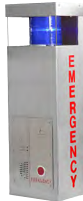
ETP-WME Economy Option