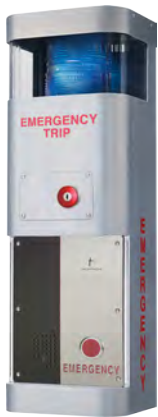
ETP-WM-TPK-IP66 Emergency Trip