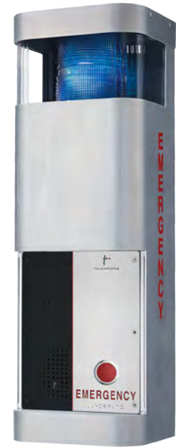
ETP-WM Wall Mount