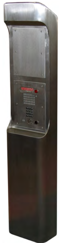
ETP-PMD-SS shown with ETP-400K and 25141 blank stainless faceplate