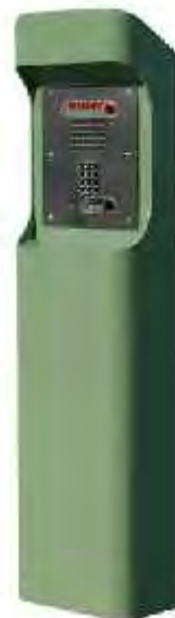
ETP-PM shown with ETP-400K