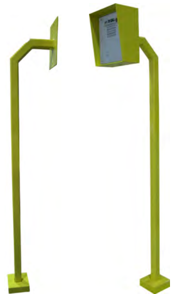
Shown with ETP-SMH

Mounting: Mounts into concrete foundation using anchor bolts