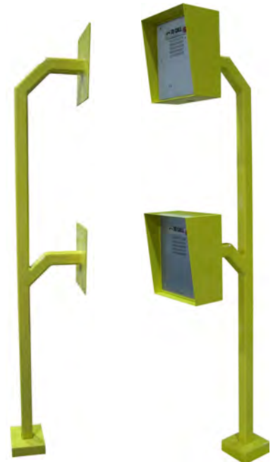
Shown with ETP-SMH

Mounting: Mounts into concrete foundation using anchor bolts