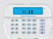
DSC Alarm Panels