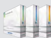
EntraPass Security Software