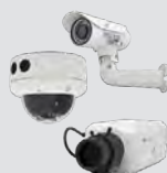
Illustra IP Cameras