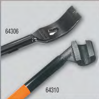
Hickeys & Grizzly Bar

Klein Tools' line of Ironworker's tools are engineered and manufactured to withstand rugged jobsite conditions and heavy use. From pliers to wrenches, rebar hickies to pins, leather and canvas pouches to connecting bars, each tool has been thoughtfully designed around the worker. Whether it's rebar work or structural work, Klein has something to meet the Ironworker's daily needs.