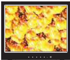
Before 3D Motion Adaptive De-Interlacer

In signal processing, a motion adaptive adds a delayed version of a signal to itself, causing constructive and destructive interference. The frequency response of a motion adaptive de-interlacing consists of a series of regularly-spaced spikes, giving the appearance of a comb.