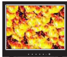
After 3D Motion Adaptive De-Interlacer