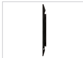
Flat panel mount collapses to 1.5 in. from the wall