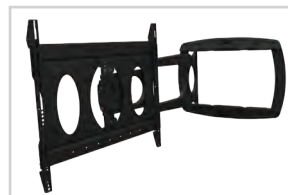
Expands flat panel displays up to 30 inches from the wall