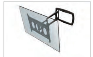
Designed to offer 15 degrees of downward tilt for today's slim line flat panels