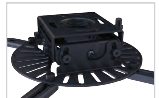
Can mate with a standard 1.5" NPT or directly to structural surfaces