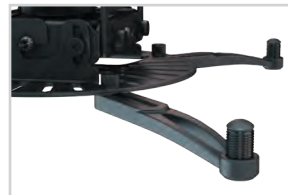
Patented Lock-It™ security hardware and leveling barrel provide protection