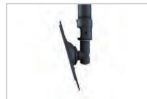
Radial Glide™ offers 15° of pivot adjustment in any direction