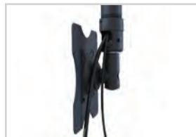
Cable routing through extending pipe (and/or NPT Adapter) for a clean look