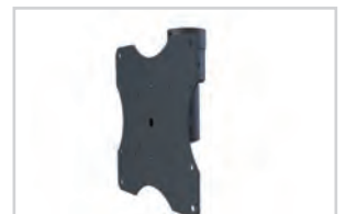
PRC-LA available as a basic option without an extension pipe