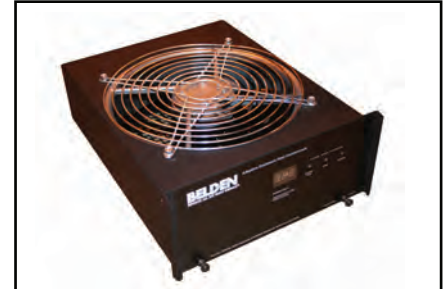
Intelligent hot swappable fan cartridges allow for ease of maintenance and system scalability.