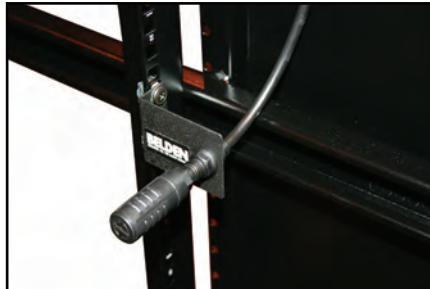
Belden's AEHC system utilizes pressure sensing to dynamically adjust for speed, resulting in perfect balance between intake and exhaust air volume.

With Belden's AEHC approach, since the room is normalized with cool air and all heat is contained, the cooling source can be located anywhere in the room. Cool air can potentially be fed to enclosures from a duct, enabling freedom of room infrastructure design and eliminating the need for a raised floor. Whatever the means of delivery of conditioned air for a normalized room, the Belden system works to perfectly match the correct amount of air for the IT load.