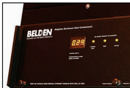
Belden's AEHC system features external displays for quick and easy assessment of system load and alarm conditions.