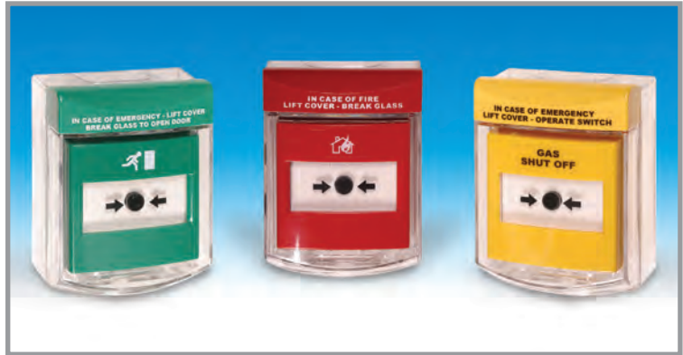
Call Point Stopper colours available

The Call Point Stopper is supplied in red with operating instructions: 'IN CASE OF FIRE - LIFT COVER BREAK GLASS'. Alternative and custom markings available.