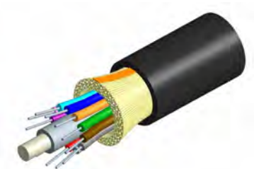
760037218 | P-024-OD-8W-FSUBK Indoor/Outdoor Plenum Distribution Cable, 24 fiber single-unit