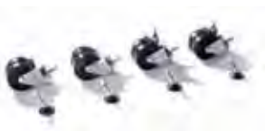
Castors & feet