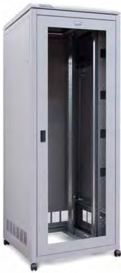
Model Shown: CAB4288