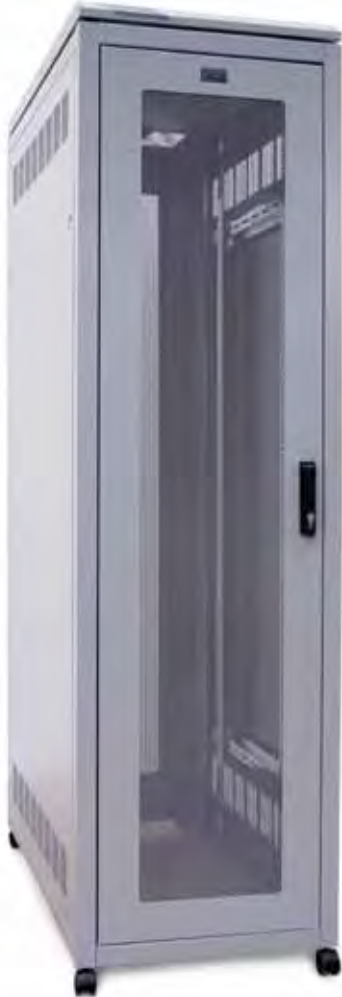
Model Shown: CAB4268