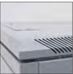
Multiple cable access points fitted

It's design has evolved from continuous development with today's installation teams.