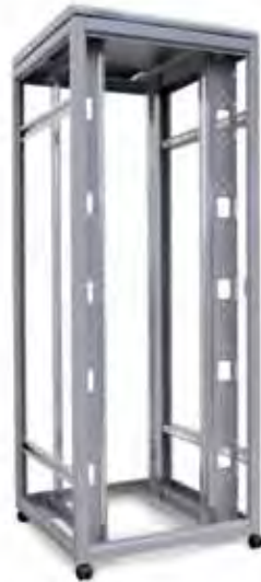
Bolted steel frame chassis