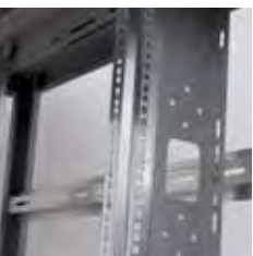
Vertical cable management On 800mm wide enclosures