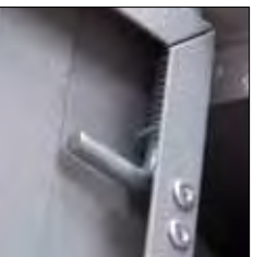
Quick release hinge system provides maximum space during installation