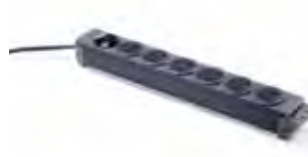
Power distribution units