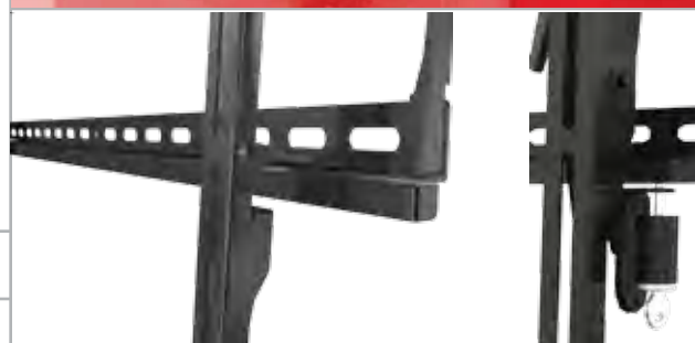
Kickstand for easy cord installation