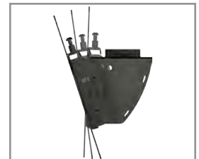
Tilt 0 to +20° tilt for optimal viewing angles.