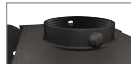
Mounting Surface Standard 1.5" NPT threaded connection.

VESA compliant with 75X75mm, 100X100mm, 200X100mm and 200X200mm sizes.