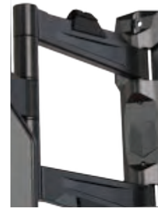
Decorative covers hide screw heads