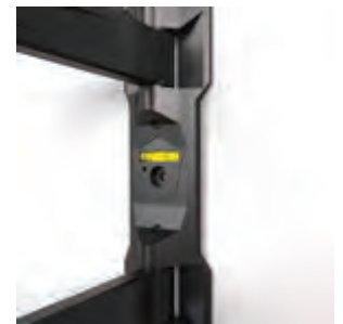
3 Attachment points and a built in level