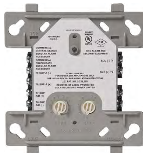
MMF-300(A) (Type H)

Use to monitor a zone of four-wire smoke detectors, manual fire alarm pull stations, waterflow devices, or other normally-open dry-contact alarm activation devices. May also be used to monitor normally-open supervisory devices with special