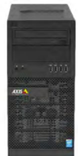
AXIS S9001 Desktop Terminal sold separately