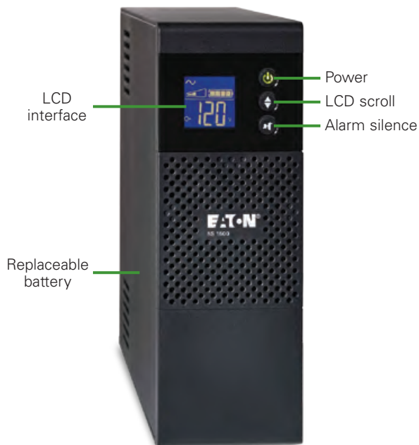
Model displayed above: 5S1500LCD