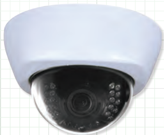
TVIDTW212IR Shown with White Paintable Snap-on Cover (included)