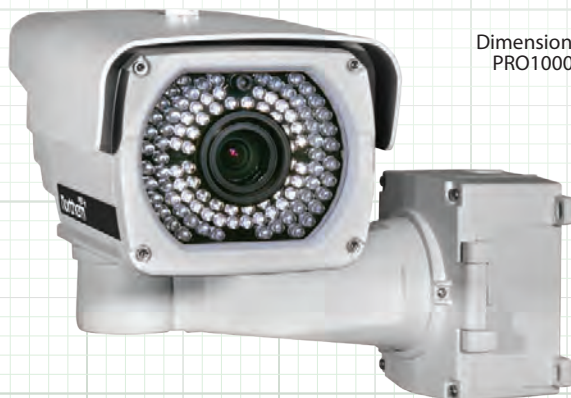
Dimensions & Photo for both PRO1000B3 / PRO1000B6