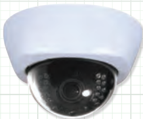
DTW212HIR960 Shown with White Paintable Snap-on Cover (included)